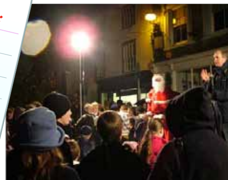
Last years 'Big Switch On' - A traditional fun filled family event for Clare.