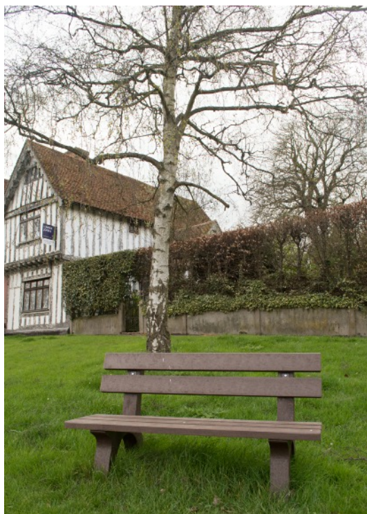
A new bench in Callis Street

Working on a reduced budget the Environment Committee has maintained the standards expected for the upkeep of the Cemetery, Nuttery, Churchyard, greenswards, trees, grass cutting and street cleaning.