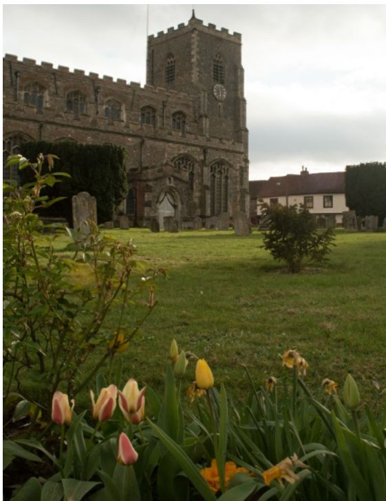
Spring Flowers at Clare Church