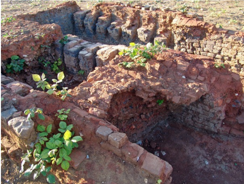
The brick kiln discovered at the site of the Charles Church development