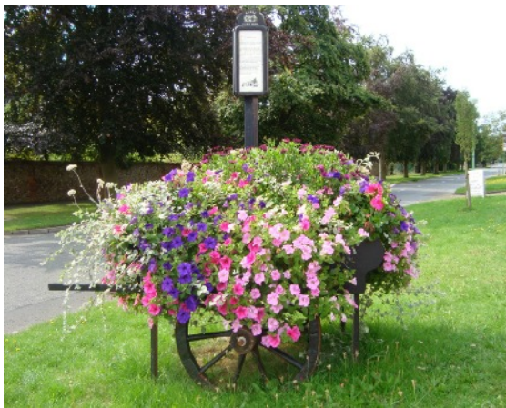
A decorated cart on Nethergate Street

This spring the church border and containers are spectacular and Clare in Bloom has received many compliments and thanks.