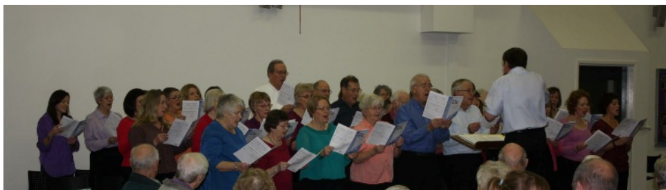
The Treble C Choir

Our membership has now grown to more than 70. In addition to rehearsing regularly in the United Reformed Church we contribute entertainment to the community. This year we sang at the CLASP Senior Centre Christmas lunch and participated in the Clare Community Carol Service in the Baptist Church.