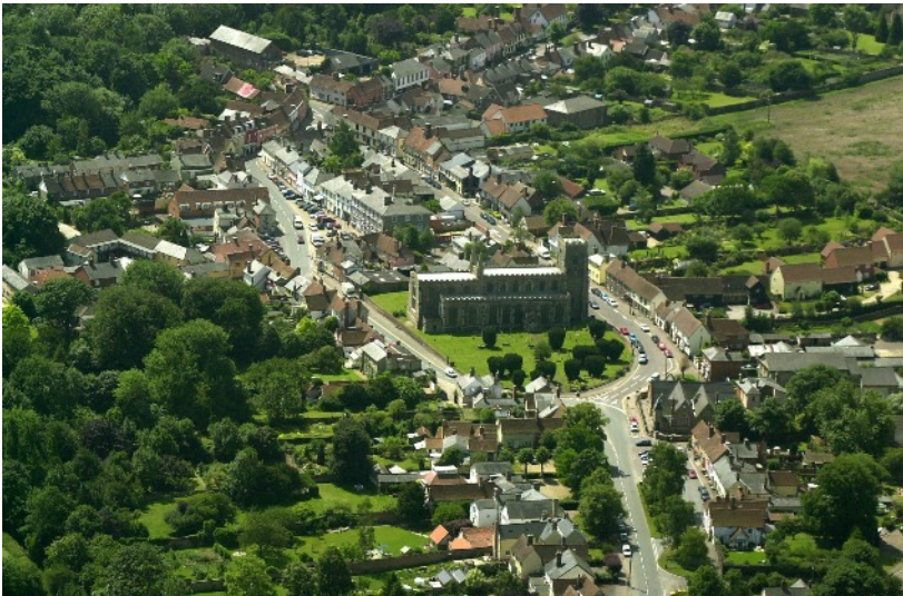
Clare from the air