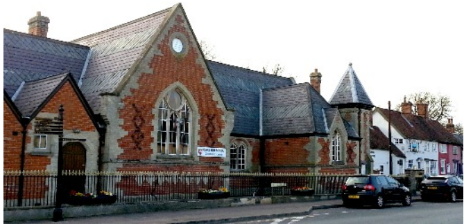
The Old School Community Centre

CHOC Trustees fundraising events in 2013 included a traditional Burns Night, two Quiz Evenings, and an Open Morning which included a plant sale. We are grateful for help given at these events by volunteers, and for support from the people of Clare.