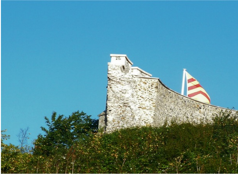
Clare Castle motte

The transfer of the Park from Suffolk County Council (SCC) has been under discussion for about four years. In August 2012, on the basis of a detailed proposal by Clare Town Council, SCC decided to negotiate with the Town Council as the preferred future owner.