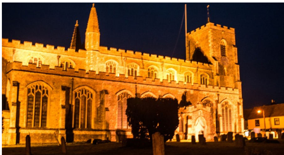
The Parish Church of St Peter & St Paul at night